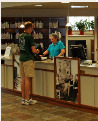
Hartland Public Library

The key to any successful operation is a knowledgeable staff. Libraries have trained information professionals known as librarians, cataloguers, technical services or circulation staff. Each person plays a vital role in creating a destination people have been coming to for hundreds of years.