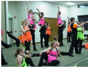
Mukwonago Community Library