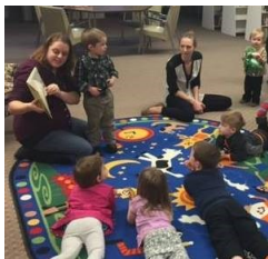
Powers Memorial Library (Palmyra)