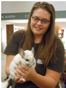
Muskego Public Library