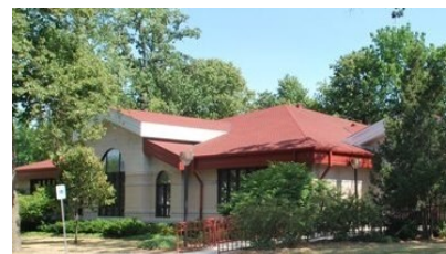
Irvin L. Young Memorial Library (Whitewater)