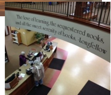
Dwight Foster Public Library (Fort Atkinson)