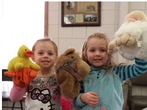
Big Bend Village Library