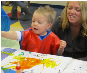
Pewaukee Public Library