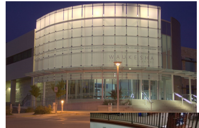
Waukesha Public Library

"The only thing that you absolutely have to know, is the location of the library." - Albert Einstein