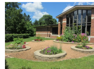
Pauline Haass Public Library (Sussex)