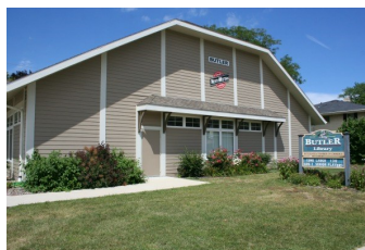
Butler Public Library