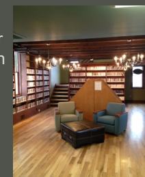
Town Hall Library (North Lake)