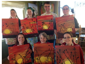
Karl Junginger Memorial Library (Waterloo)